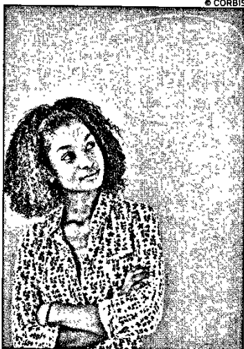
BRIGHT SPARK: How you teach matters

"It's really what's going on in the students' minds rather than who is instructing them," said lead researcher Carl Wieman of the University of British Columbia, who shared